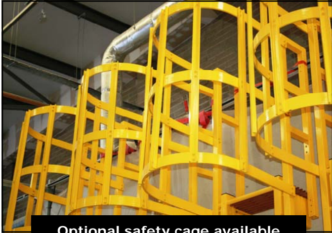
Optional safety cage available

Pipex px® phenolic FRP Ladders are engineered from corrosion resistant advanced composites using phenolic resin, to attain the ultimate strength and fire resistance to withstand the harsh Offshore environment. Phenolic FRP comprises of superior strength, durability and longevity, as well as providing significant weight savings (typically 1/3rd of steel) compared to traditional materials.