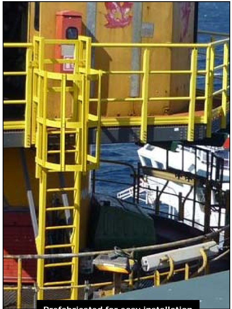
Prefabricated for easy installation