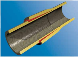
Quick-Lock® adhesive-bonded joint