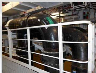
Large seawater ballast piping