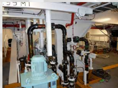
Bondstrand in the machinery space